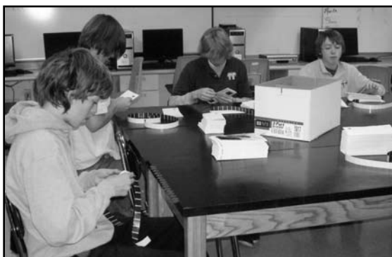
Students applying the wafer seals on the newsletter.